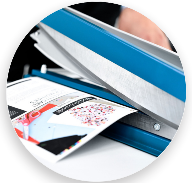
Self-sharpening system maintains a perfectly honed blade.